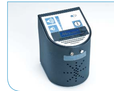
The 20 MHz surgical Doppler system