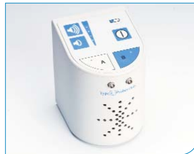
The 8 MHz surgical Doppler system

The Mizuho 8 MHz Surgical Doppler System is an easy-to-use, portable, audio blood flow detector that identifies and assesses critical blood vessels. The system's disposable probes, along with the 8 MHz Transceiver, is specifically designed for delicate surgical procedures. The sterile, single-use probes help ensure patient safety while offering you substantial efficiency and convenience.